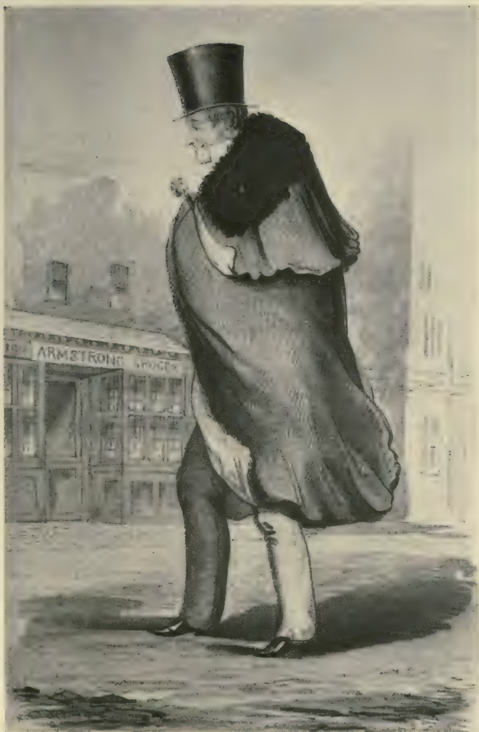
BEAU BRUMMELL IN HIS OLD AGE, AT CAEN